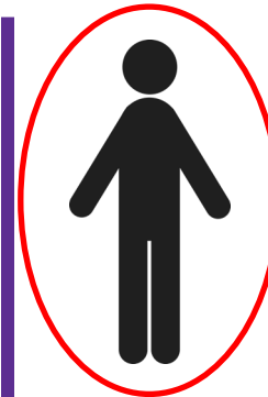
Child is Waiting For Test Results