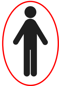
Child Not Feeling Well – general sickness