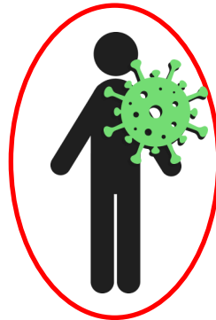
Child is COVID-19 Positive